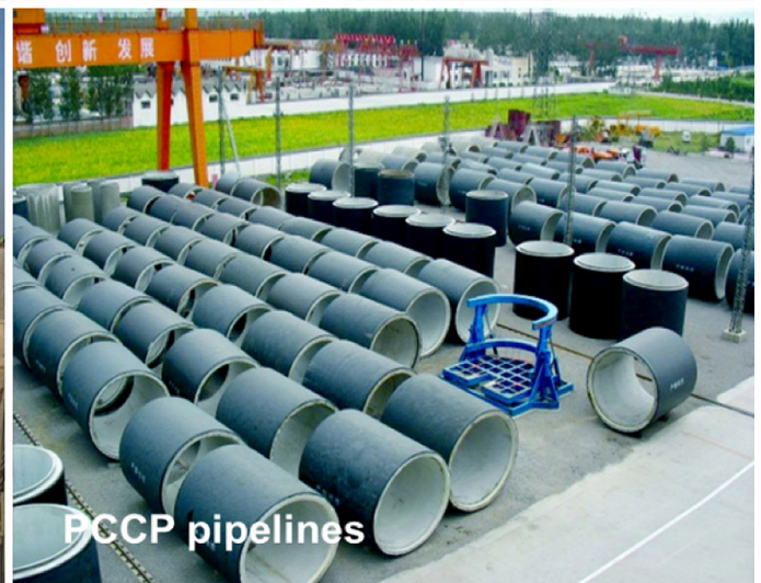
Figure 2 | Major engineering projects in SNWDP.