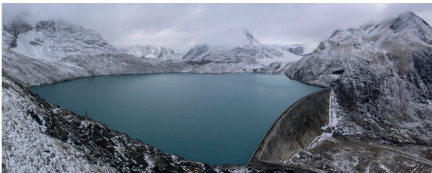
Figure 1. Griessee Reservoir with retreating glacier in the background, leading to higher sediment yield.

Reservoir sedimentation is a global concern and is expected to aggravate in the near future due to climate change and the linked increase in sediment availability below retreating glaciers. There is an increasing need for efficient sediment management to maintain the active storage volumes in reservoirs and to improve the continuity of sediment transport along rivers from upstream to downstream of dams. The Laboratory of Hydraulics, Hydrology and Glaciology (VAW) of ETH Zurich, Switzerland, has conducted several basic and applied research projects on reservoir sedimentation and possible countermeasures (e.g. sediment bypass tunnels and increased fine sediment transport through power waterways).