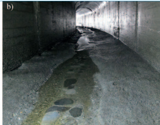
Figure 2. (a) Schematic view of an in-stream reservoir with sediment bypassing [7] and (b) abraded concrete invert of the Runcahez SBT, Switzerland