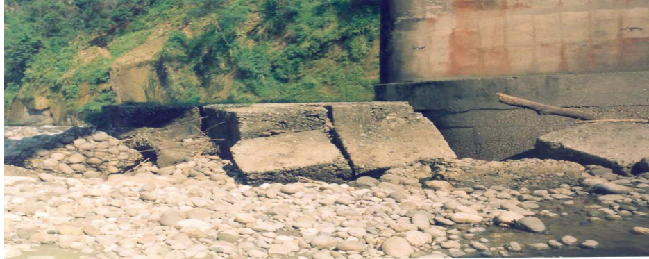
Fig 4 Scour around pier