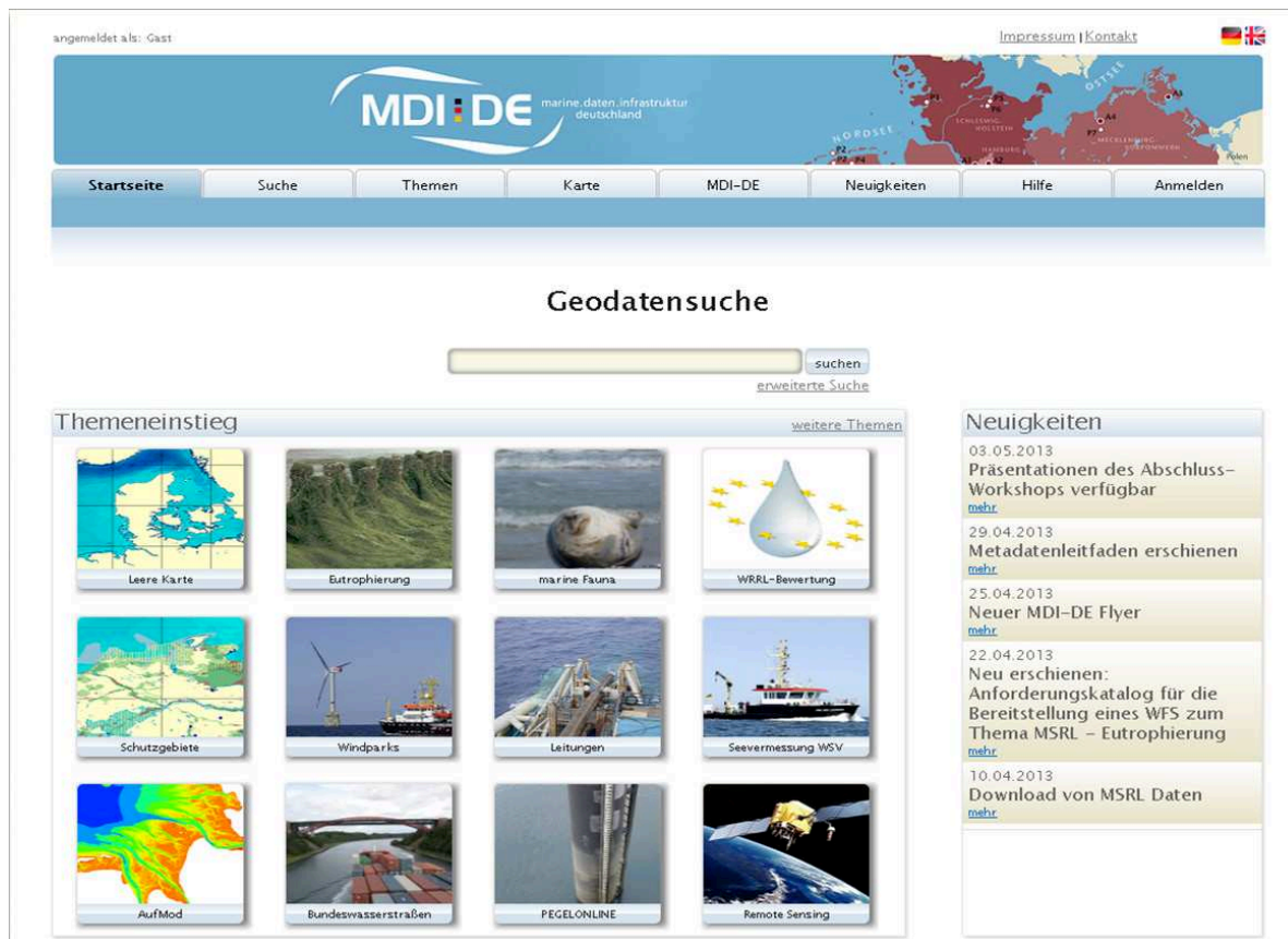
Figure 2. Web portal Marin Data infrastructure Germany – MDI-DE

The participating agencies or institutes are thematically or geographically responsible for the marine environment, marine conservation and coastal engineering. Their spatial data are made available by OGC compliant Web services and documented with metadata according to the ISO standard thus fulfilling the INSPIRE interoperability requirement. The Web portal www.mdi-de.org serves as central entry point for data and information from the German coastal zone and the adjacent marine waters. This facilitates intersectoral views of resources by providing technological solutions of networking and distributed data management.