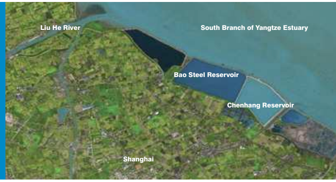
Figure 2. Map of Chenhang Reservoir