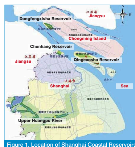
Figure 1. Location of Shanghai Coastal Reservoirs

The Yangtze estuary has abundant fresh water resources of good and stable water quality that account for 98.8% of the total water resources in Shanghai. Its water quality meets the Chinese standard of fresh water for drinking purposes, and has a relatively high self-purification ability. It is better than surface water in other areas of Shanghai. The fresh water resources of the Yangtze estuary have great potential for development and utilization. Therefore, the development of the Yangtze estuary can satisfy not only the incremental fresh water needs, but also can improve the quality of the Shanghai water