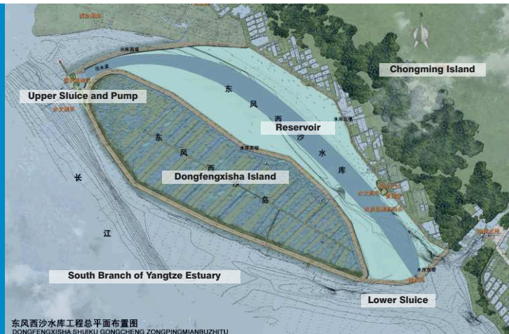
Figure 5. The Schematic Layout of Dongfengxisha Reservoir