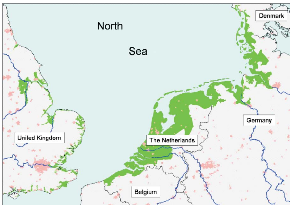
Fig. 1: Coastal flood-prone areas (green) in the southern North Sea region

In the year 1996, on the initiative of the Danish Kystdirektoratet, leading national and regional coastal risk management authorities in the Netherlands, Belgium, the UK, Ger-