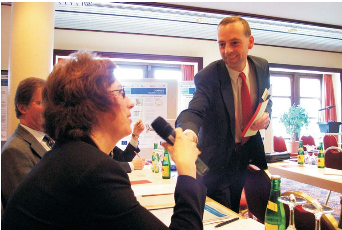
Fig. 3: Discussion of project results during COMRISK2005

In two further sessions, researchers presented relevant project-external results. In a final session, several technical, managerial and policy level statements that were prepared by the organising COMRISK project team were presented and discussed (see contribution HOFSTEDE et al. in this volume). The conference ended with a boat excursion to the Probstei sea wall, the largest coastal risk management measure in the Baltic Sea.