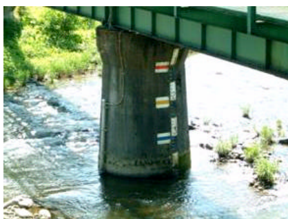
Fig.2 water gauge.