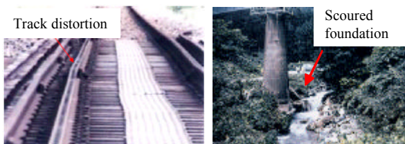
Fig.3 Site-situation of scour hazard occurred in 1995.

water level hardly rises during flood. The rule based on observation of inclination of a bridge pier is applied to these bridges. A clinometric type scour monitoring device 1) is placed on the top of bridge piers, and monitors the inclination angle in real time (Fig.4). The threshold angle for the train suspension is derived from geometric relationship between the inclination angle of the bridge pier and maintenance limits of track irregularity. When inclination angle of a bridge pier exceeds the threshold angle, this device gives an alarm to suspend train operation. Approximately 300 scour monitoring device are installed on bridge piers and monitor inclination of bridge pier in real time.