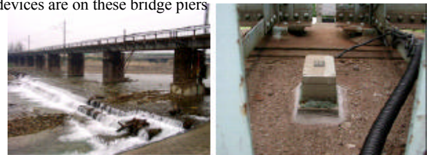
Fig.4 Clinometric type scour monitoring device.

Clinometric type scour monitoring devices are on these bridge piers