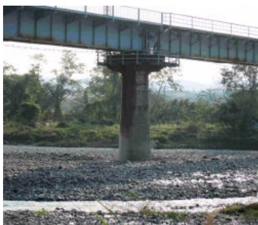
Fig.6 The field testing on actual railway bridge

The concept of new scour monitoring device is introduced in this article. In this article, the outline of the proposed scour monitoring device to solve the